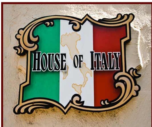
The House of Italy