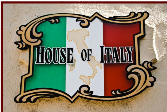
The House of Italy